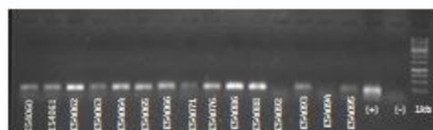
Fig. 5. Gel electrophoresis for detection of Badnavirus using RT-PCR with specific primer. BadnavG from birch samples.