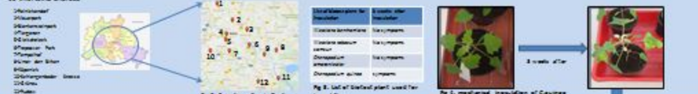
Fig. 2. Sampling sites in Berlin. Fig. 3. List of biotest plant used for inoculation. Fig. 4. Mechanical inoculation of Chenopodium quinoa .

Primers were designed for viral detection of infected leaves from different sites in Berlin as shown in map below (Fig. 2). Investigation of plant viruses was done by using RT-PCR to test for Cherry leaf roll virus (CLRV) and Apple mosaic virus (ApMV), which are commonly associated with deciduous trees. The diversity of symptoms and the newly discovered viral species (Carle- and Badnavirus) in Betula spp. led to the assumption of a mixed infection with unknown viral origin. Biotest experiment was carried out to check if newly found Carle- and Badnaviruses were mechanically transmissible. This was done using Chenopodium quinoa since other plants showed no symptoms (Fig. 3). Symptoms like ringspots and intercostal chlorosis were observed three weeks after inoculation and evaluated by RT-PCR (Fig. 4).